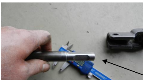
14mm A/F section on input shaft adaptor to fit lower output coupling.