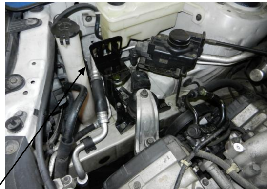
New "Modified" Bracket welded and bolted back into place on the vehicle.