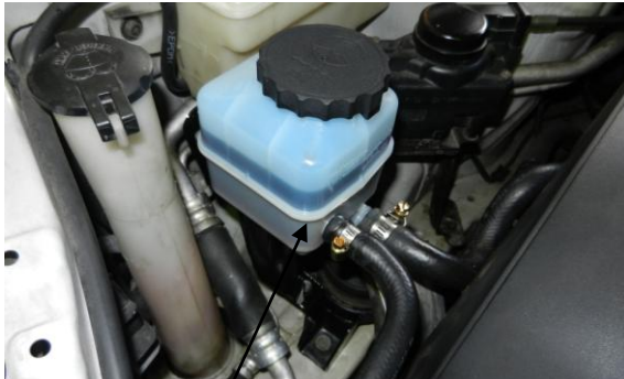
New reservoir and "Modified bracket" on the vehicle with original return and supply hoses fitted.