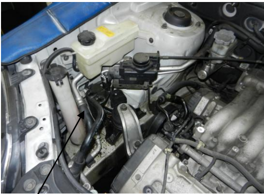
Old Res and bracket removed.

Remove the old reservoir & bracket then modify "New" bracket to fit the vehicle.